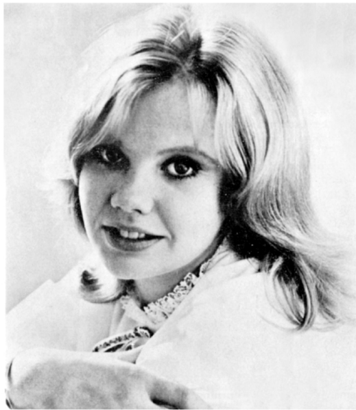
HAYLEY MILLS answers questions for reporters.