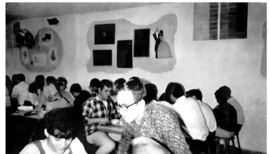
This picture, taken during the 5th period lunch, shows several groups eating lunch while the pictures brighten up the cafeteria in the background. The pictures are done by different artists in Miss Davis' and Miss Godwin's Art I and III classes. The pictures were of great variety, ink drawings, pencil and paint being among them.