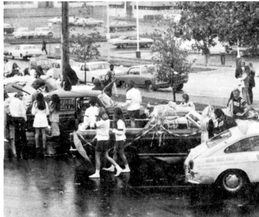
Despite the soggy weather SW's spirits weren't dampened as the Homecoming Parade, consisting of 28 cars rolled out of the lower parking lot last Saturday.