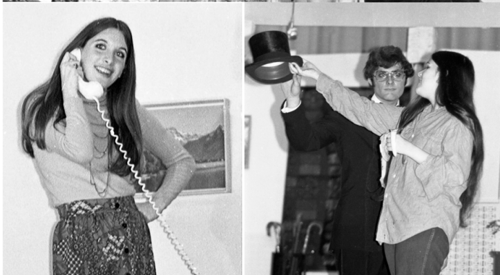
PIONEER takes a view from behind the "Stage Door," April 20, 21.